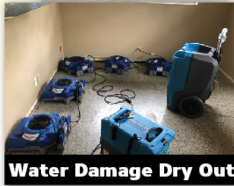
Water Damage Dry Out

A/C Leak? Water Stains Under Sink, Under Windows, Or On Walls? Plumbing Leak? Toilet Overflow? Paint Bubbling? Musty Smell? Baseboards Separating From Wall? Roof Leak? Storm Damage?