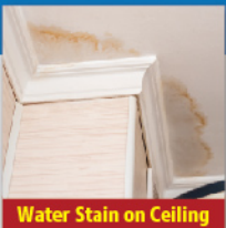
Water Stain on Ceiling